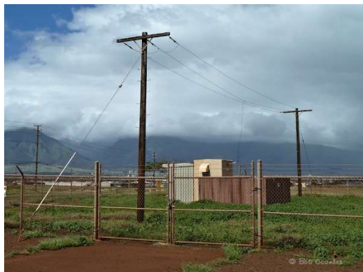
(Left: VYI 327 kHz near Kahului, Hawaii,)